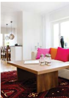
A whole new neighborhood is emerging in Solna/Sundbyberg just north of Stockholm, Sweden. Järvastaden is expected to have 12,000 residents within a few years.

“Residential Development 2009” presents Skanska’s residential development operations in detail. Residential development projects occur only in some markets where Skanska has a permanent presence: Sweden, Norway, Denmark, Finland and the Czech Republic. Finnish operations also include residential development in Estonia.